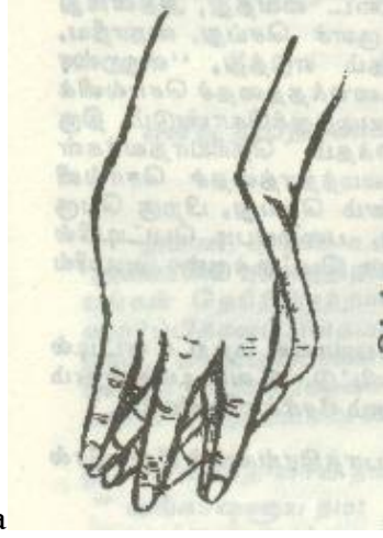
Image of surabi mudra

Do shoShaNam,daahanam plaavanam and surabi mudra for the all the five vattils.